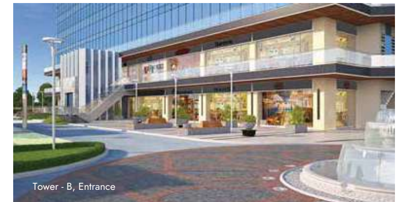
Tower - B, Entrance