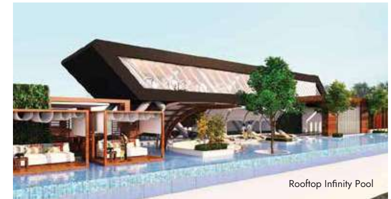
Rooftop Infinity Pool