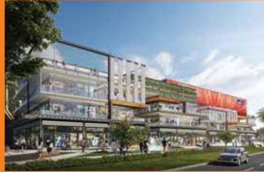
CITY CENTER 150 SECTOR - 150, NOIDA

City Center 150 is a glimpse into the future of retail and lifestyle entertainment. With al-fresco style high-street retail in a low-rise development, the project is built to immerse visitors in a world of seamless convenience.