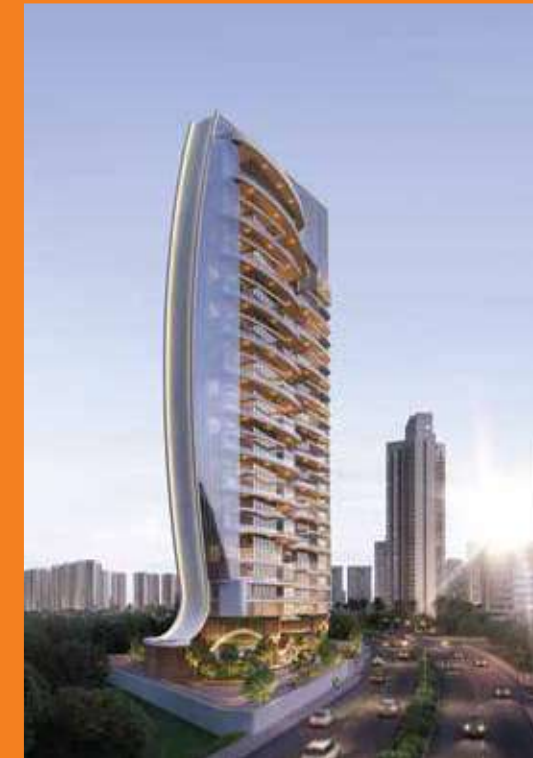
18 BHUTANI EIGHTEEN ULTRA LUXURIOUS CONDOMINIUMS

Part of a 26.8 acres mixed-use development, Cyberthum is NCR's tallest commercial tower with world-class spaces, mall in the sky, and Bolt, one of India's biggest gaming and entertainment centers.